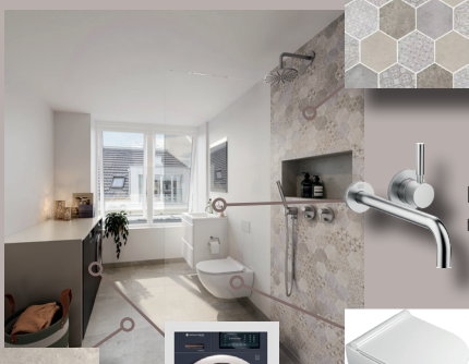
Wet room tiles (shower)