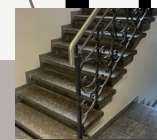
Original stairs in wood and stone