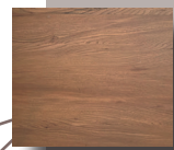
Wooden doors and handrails