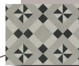
Ceramic tiles (replica)