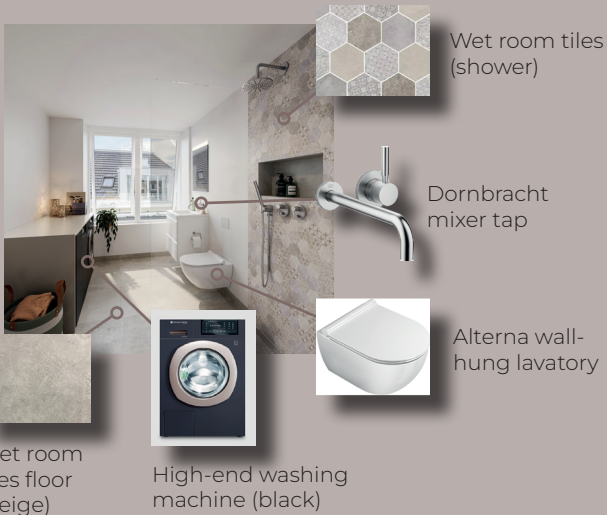
Wet room tiles (shower)